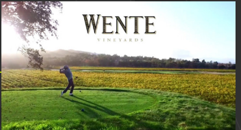
Pass Livermore's largest winery, Wente Vineyards & Golf Course