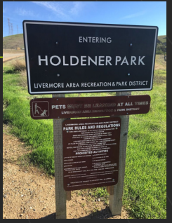
Run through Holdener Park with a great view of downtown!